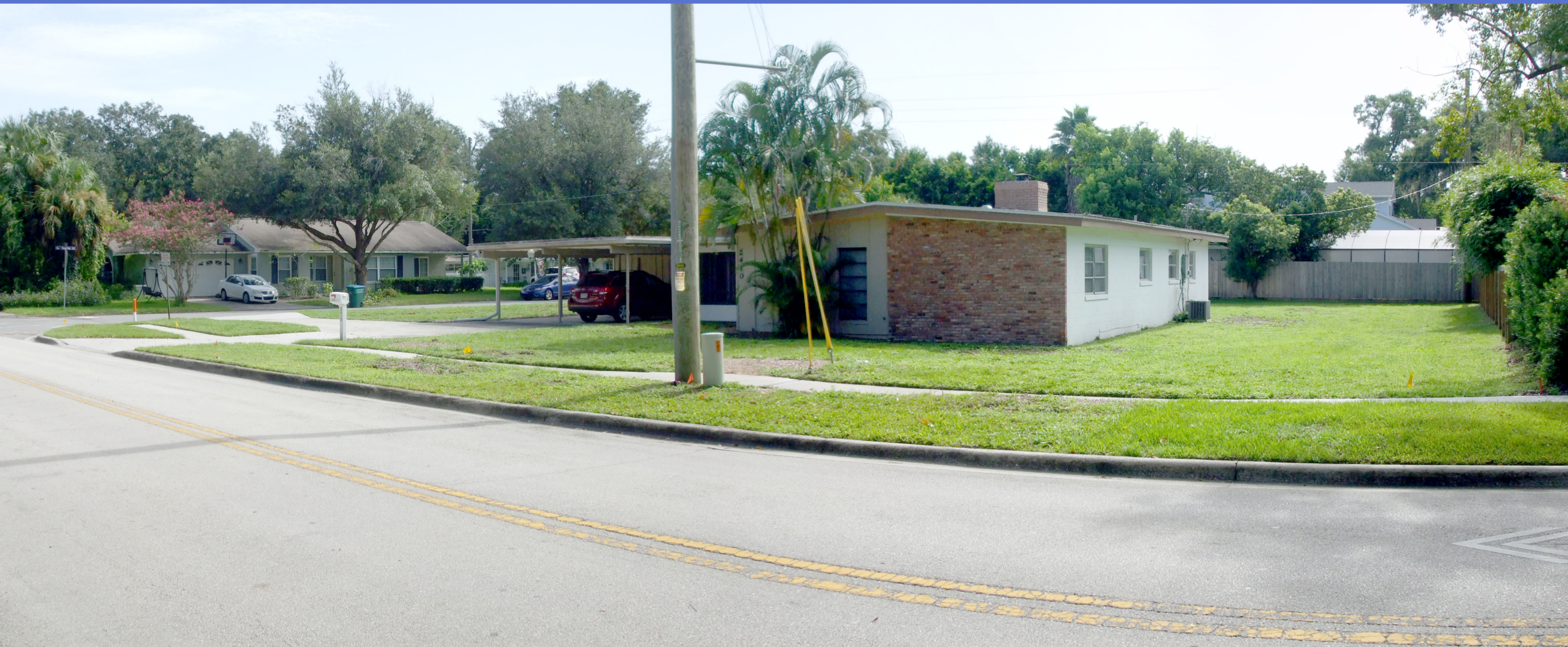
Existing Street View