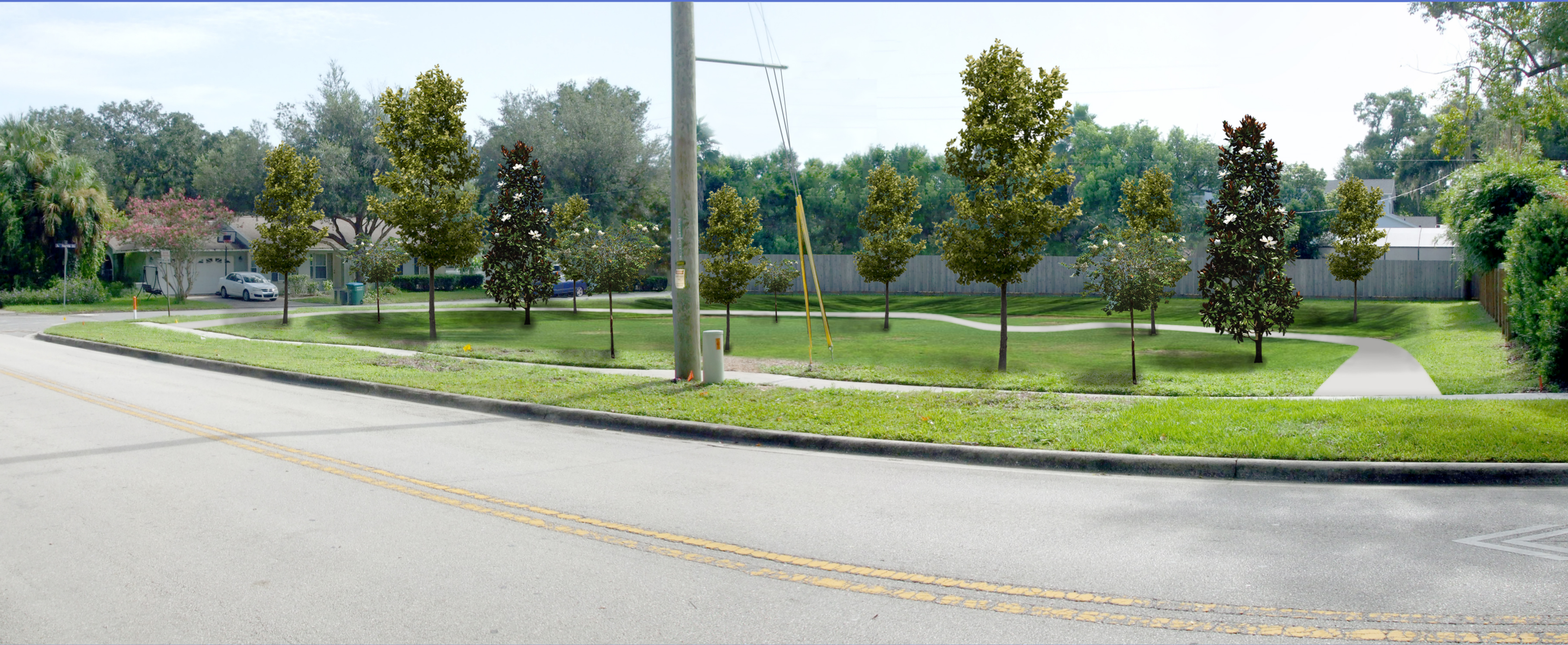
Proposed Pond / Park Street View